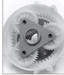
Planetary Gear System

We are capable to produce the following 5 gear systems: