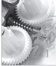
Worm Gear System